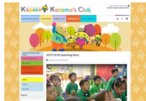
Kokomo Club Private Members' Web Example