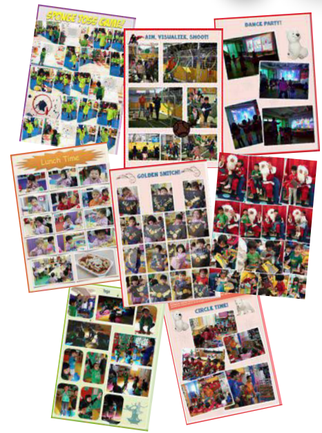
Sample of past Winter School newsletters

You will also receive a set of forms to sign. In this authorization pack you will be asked to sign a notice that gives us permission to photograph and record your child. Unfortunately it isn't possible in the Seasonal School periods to segregate individual children or make special arrangements whilst recording. We are here to answer any of your questions.